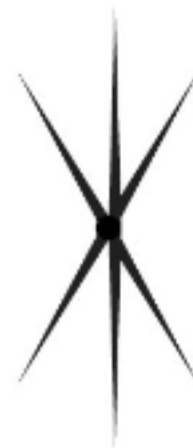
Mirror too close