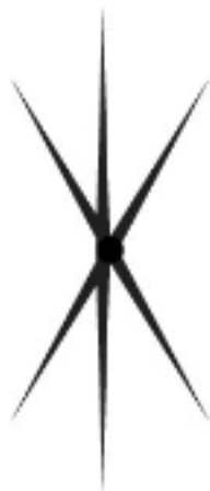
Mirror too far